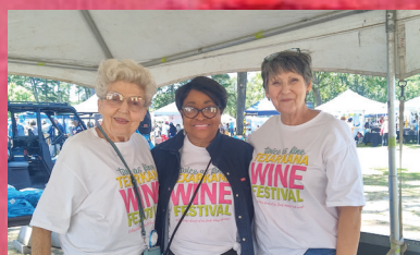
Volunteers and Friends at Our Place Day Respite Center